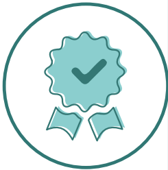
All glazing BS6206 compliant