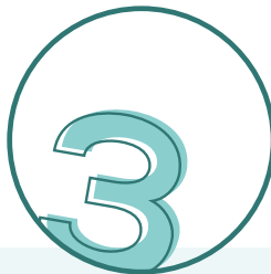
3-year warranty on all installations, parts & labour