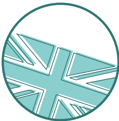
Made in the UK

Combining superb functionality with outstanding design, all our internal glass panel doors are made-to-measure utilising our sleek Super Slim aluminium frame for enhanced sightlines and maximum glazed areas.